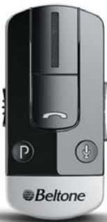
Direct Phone Link 2