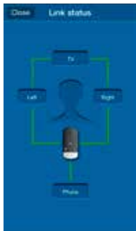
📶 Link status

Tap a Hearing instrument program or a Streaming program button to activate a regular program or streaming from one of your Beltone Direct™ wireless accessories.