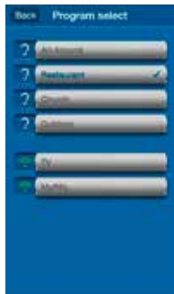
☰ Program select

Tap the menu icon button at the top of the Volume Control screen to select a hearing aid program optimized for a particular hearing situation.